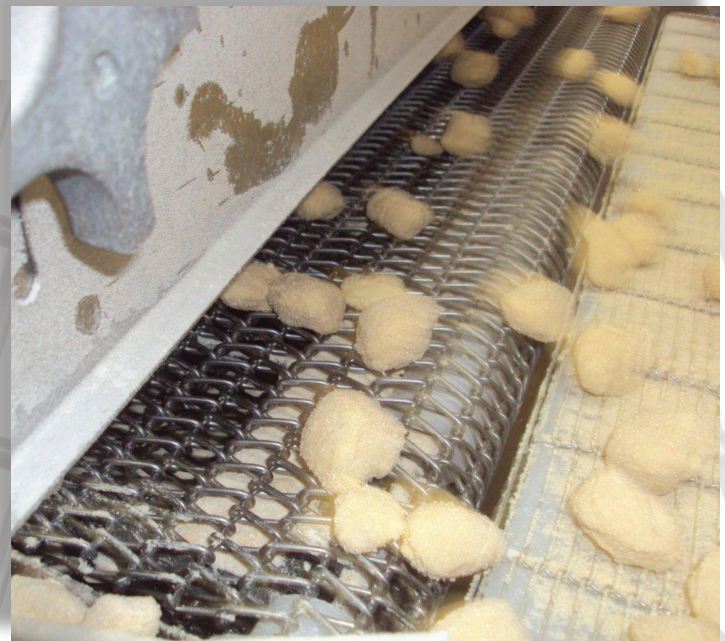
Breader Belt after running 6 months. Note: minimal carry-over.